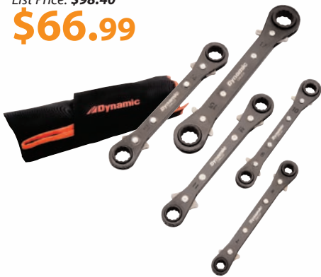
5 Piece Double Box End Reversible Ratcheting Wrench Set (25° Offset)