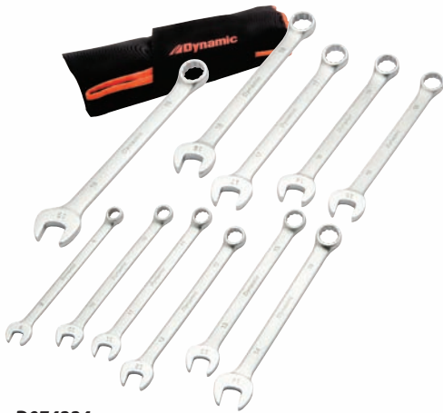
D074224 11 Piece Metric Satin Finish Combination Wrench Set - Contractor Series