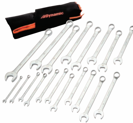
D074223 19 Piece Metric Satin Finish Combination Wrench Set - Contractor Series