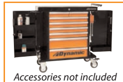
Accessories not included