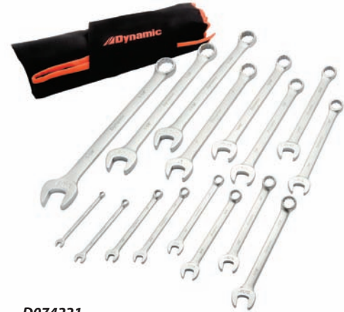
D074221 16 Piece SAE Satin Finish Combination Wrench Set - Contractor Series