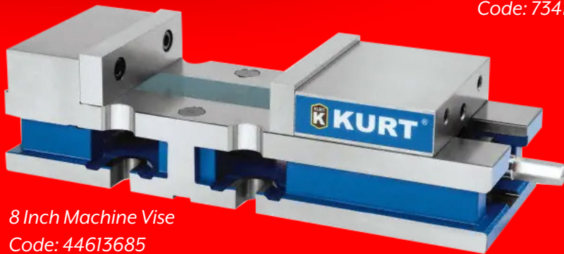
8 Inch Machine Vise Code: 44613685