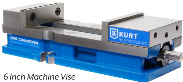
6 Inch Machine Vise Code: 37609880

The Kurt Difference Innovating. Improving. Impressing. PRECISION BY DESIGN... PERFECT BY DESIRE.