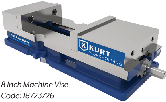
8 Inch Machine Vise Code: 18723726