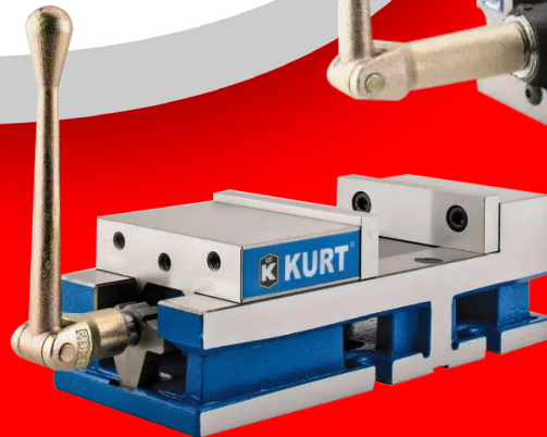
6 Inch Machine Vise Code: 09219007

When you demand quality, Kurt delivers every time. Kurt vises set the standard in reliability for CNC machining or precision workholding requirements. No other company comes close to the variety, dependability, or precision of Kurt vises. And it shows.