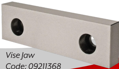
Vise Jaw Code: 09211368