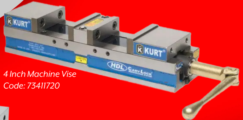
4 Inch Machine Vise Code: 73411720