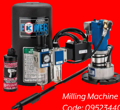
Milling Machine Drawbar Code: 09523440