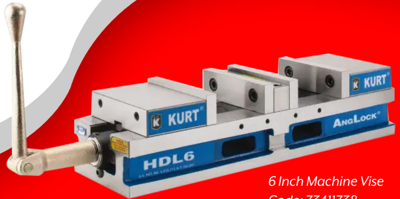
6 Inch Machine Vise Code: 73411738