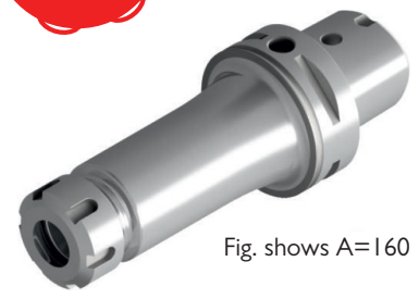
Fig. shows A=160