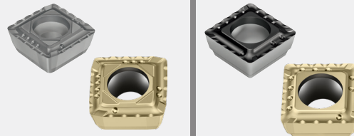
E67 – The sharp geometry