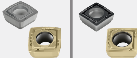
A57 – The strong geometry