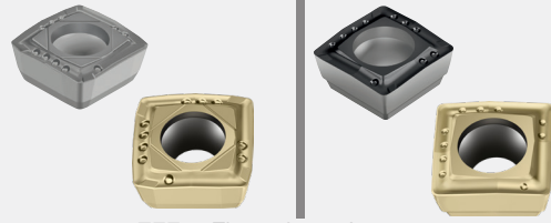
E57 – The universal geometry