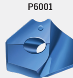
P6001 WPP45C ideal for steels (ISO P)