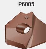
P6005 WKK45C ideal for cast irons (ISO K)