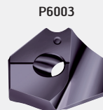
P6003 WMP35 ideal for stainless and super alloys (ISO M and ISO S)