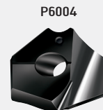
P6004 WNN25 ideal for non-ferrous materials (ISO N)