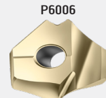
P6006 WPP25 specialist for low carbon steels (ISO P)