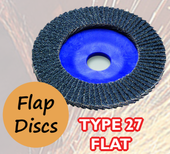
Flap Discs TYPE 27 FLAT